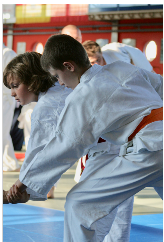
Polish Summer Camp, August 2007

Nevertheless, it is my observation that American children, in general, lack a sense of discipline. I consider that adults are responsible for this - the parents and guardians of the children. It has been a striking experience for me to observe the excessive freedom given to American children in general, and the way they are allowed to indulge in their freedom. I can't be sure, but I think that because of this they do not withstand situations well, other than situations they are fond of; which they find enjoyable and pleasurable in a rather emotional or sensuous way. As I said earlier,