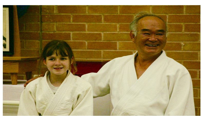
BB Summer School, Bangor, Aug 2008

The basic concept underlying recreation or sports activities in the West can be seen as the re-creation of man's original activities, associ-