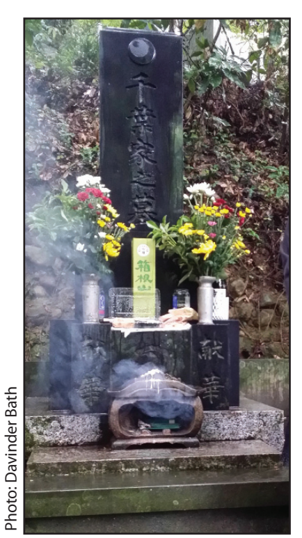
Grave of Chiba family

If you fail, don't think that you are not a gifted person. As long as you have a head, two arms, two legs, a body, and humanity as your centre, you will do perfectly well. For you are not going to perfect anybody else's art but your own. One comes to understand that there is no comparison between one's art and another's,