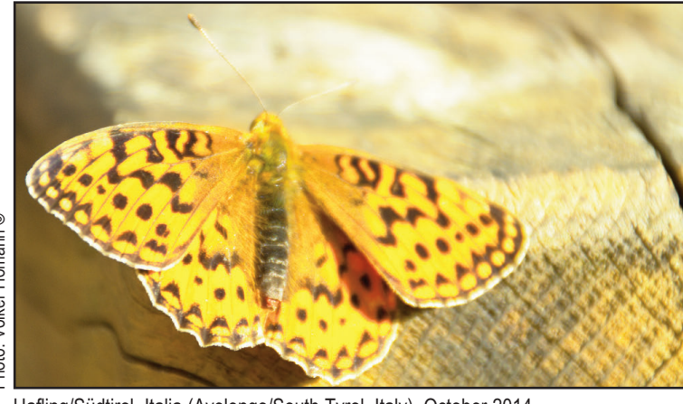
Hafling/Südtirol, Italia (Avelengo/South Tyrol, Italy), October 2014